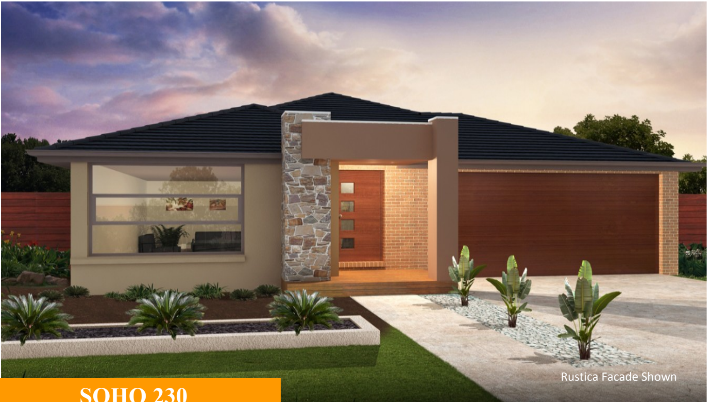
Rustica Facade Shown