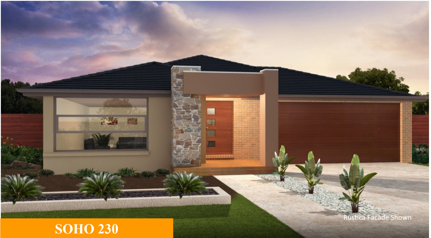
Rustica Facade Shown